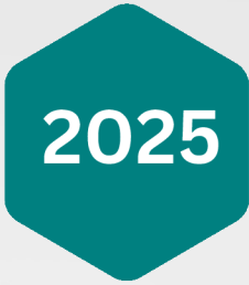
EXHIBIT BOOTH & SPONSOR CONTRACT