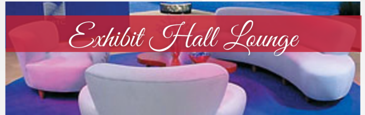
Exhibit Hall Lounge Area: $10,000 1 available Sponsor the Exhibit Hall Lounge Area, where attendees can relax and recharge with complimentary snacks and engaging activities. Your brand will be showcased in this exclusive space, offering a prime opportunity to connect with attendees and decision-makers. Snacks & entertainment included.

Showcase your company logo prominently to attendees as they check in at the registration desk each day. Your logo will be the first thing they see, making a strong and lasting impression as they enter the conference.