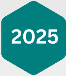
EXHIBIT BOOTH & SPONSOR CONTRACT